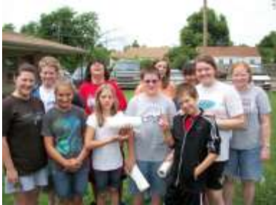
Coweta First UMC Youth

Summer, once again, has come to Exodus House Tulsa, and our campus never looked better. We are overwhelmed by the dedication exhibited by our residents, who worked tirelessly to make their home a showplace. Of course, they did get a hand from youth groups representing Coweta First UMC, Boston Ave UMC, Claremore First UMC and Muskogee First UMC. They helped spiffy up our vehicles as well as our grounds. Their combined efforts have generated a lot of compliments in the neighborhood. For many residents, Exodus House has provided the first home they have ever had all to themselves. It sure is heart warming to hear the pride in their voices as they give family, friends and neighbors a tour of their new home.