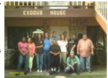
OKC Exodus House Residents

We would like to thank all of you who donate to Exodus House: we are so appreciative to you all. We are in need of good twin mattresses, twin sheets, pillows, T.V.s, dressers, end tables, dining room tables as well as any household items and other furniture.