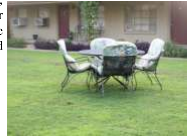
Tulsa Exodus House Courtyard

Summer, once again, has come to Exodus House Tulsa, and our campus never looked better. We are overwhelmed by the dedication exhibited by our residents, who worked tirelessly to make their home a showplace. Of course, they did get a hand from youth groups representing Coweta First UMC, Boston Ave UMC, Claremore First UMC and Muskogee First UMC. They helped spiffy up our vehicles as well as our grounds. Their combined efforts have generated a lot of compliments in the neighborhood. For many residents, Exodus House has provided the first home they have ever had all to themselves. It sure is heart warming to hear the pride in their voices as they give family, friends and neighbors a tour of their new home.